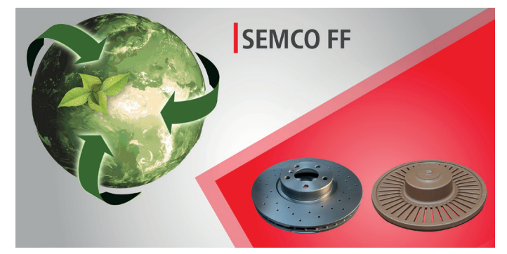
Photo: SEMCO FF is particularly designed for application on cores for ventilated brake discs.